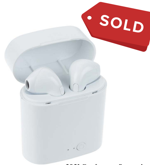
2021 Conference Souvenir