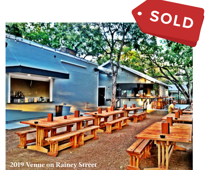
2019 Venue on Rainey Street